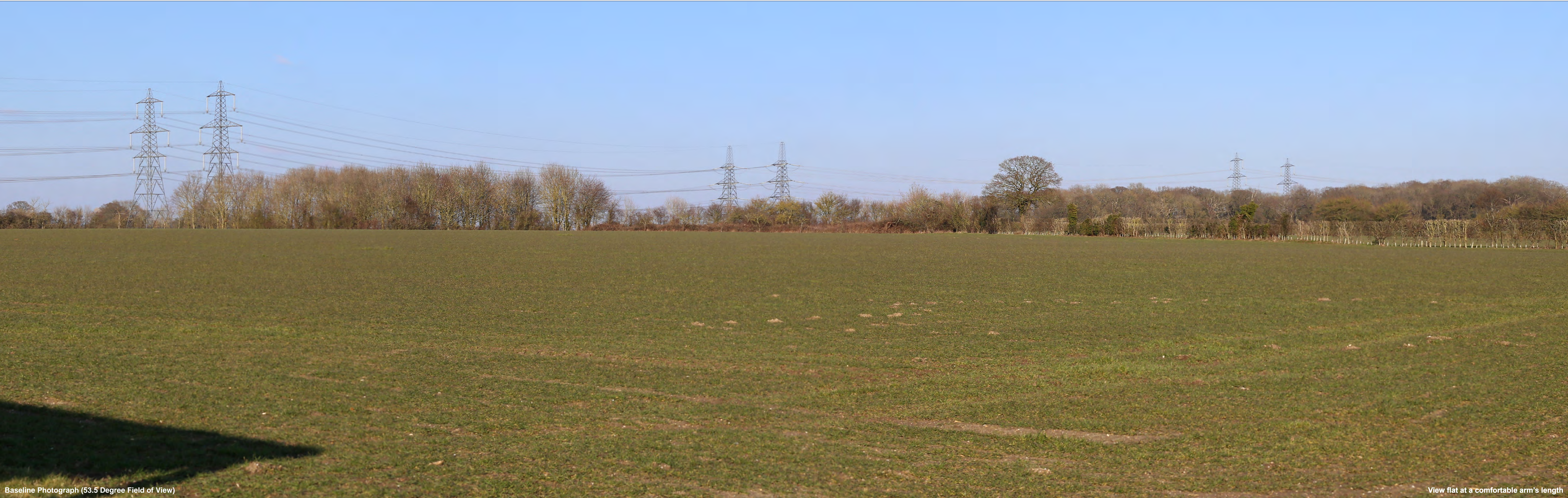
Baseline Photograph (53.5 Degree Field of View)