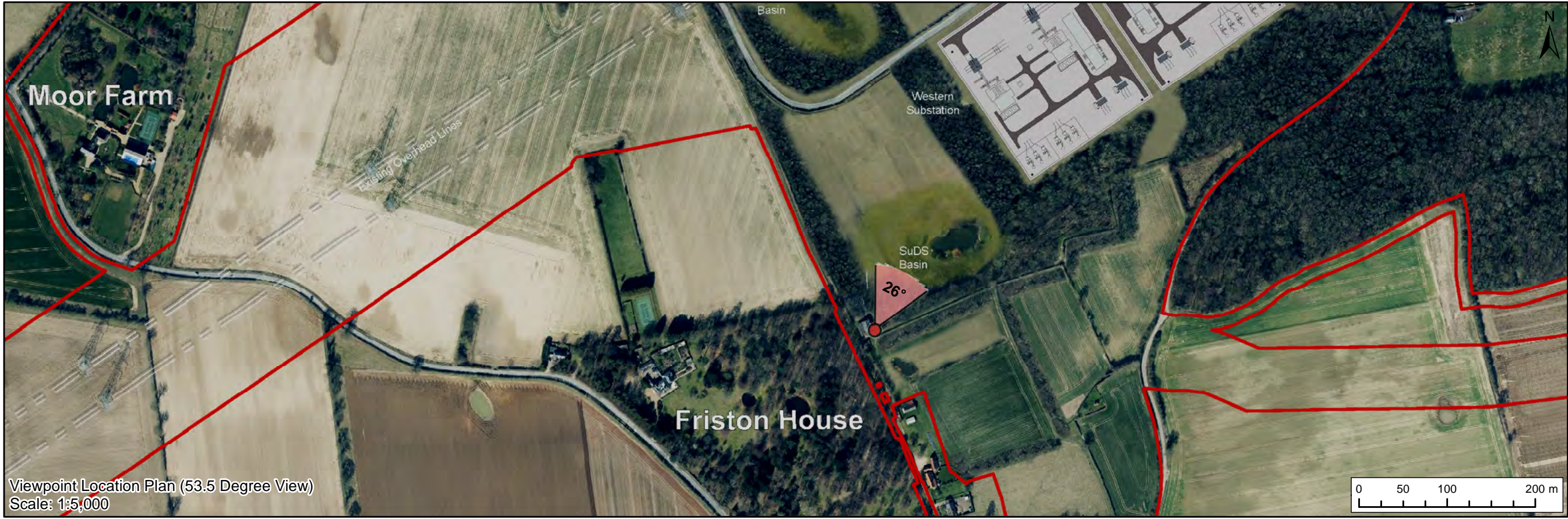
Viewpoint Location Plan (53.5 Degree View) Scale: 1:5,000