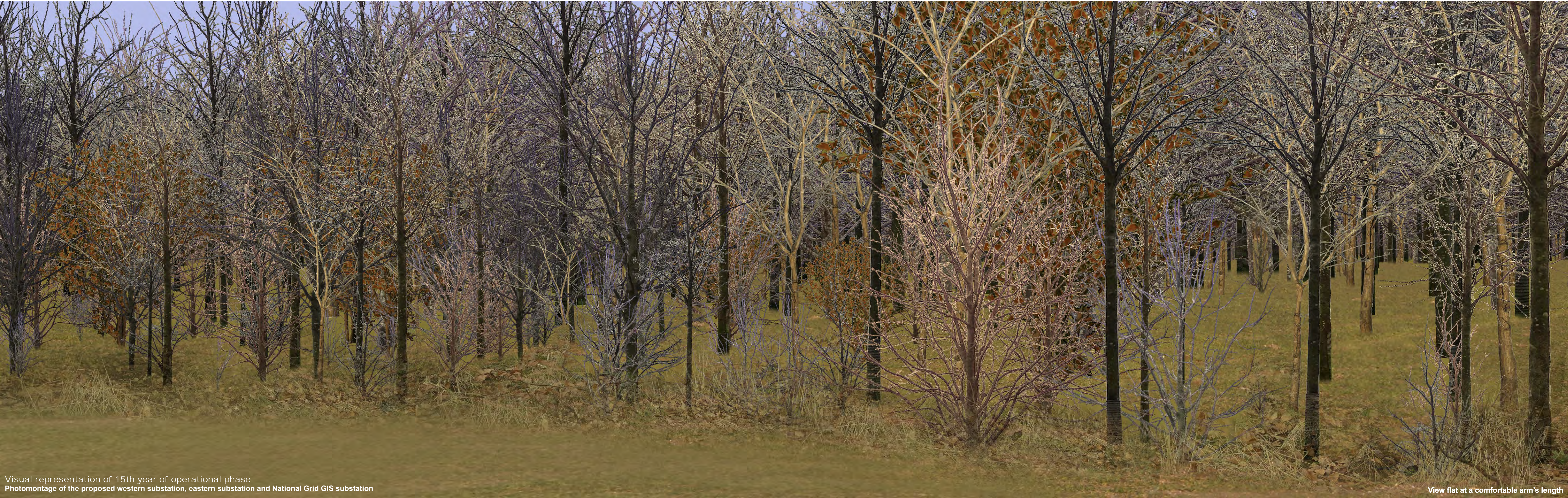
Visual representation of 15th year of operational phase Photomontage of the proposed western substation, eastern substation and National Grid GIS substation