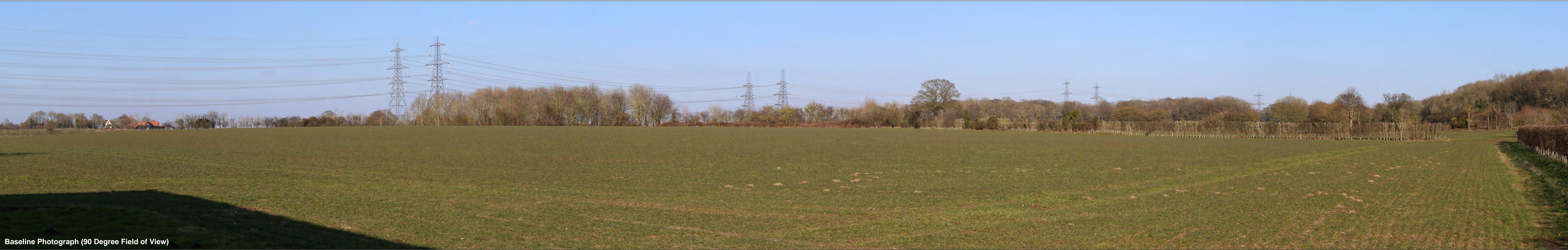
Baseline Photograph (90 Degree Field of View)