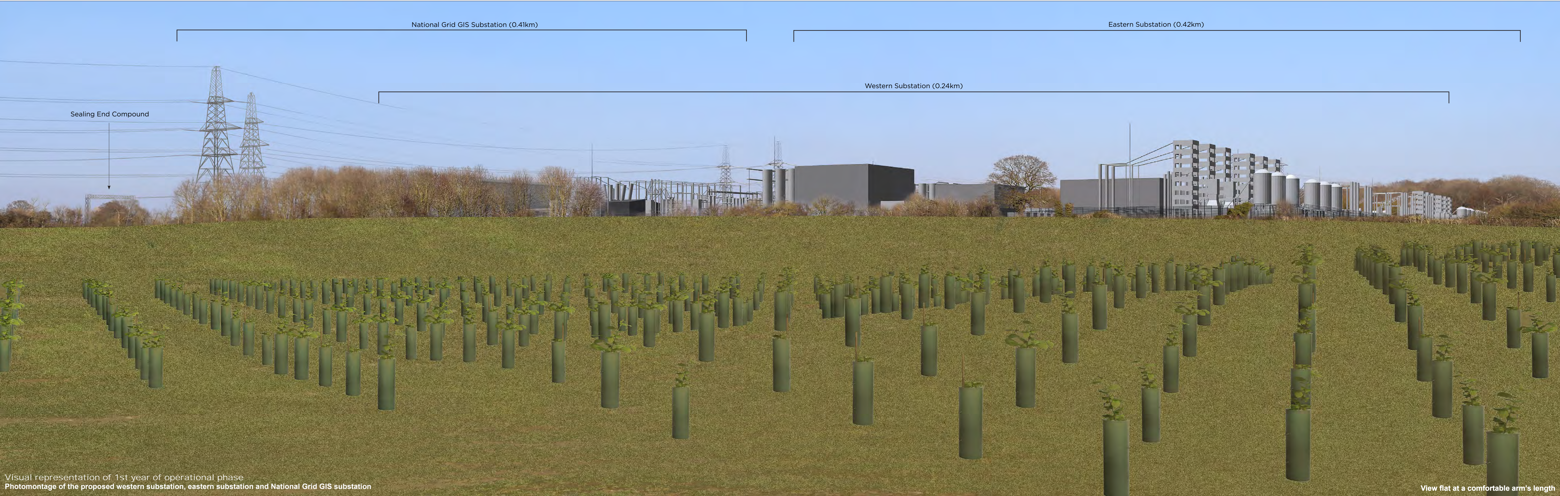
Visual representation of 1st year of operational phase Photomontage of the proposed western substation, eastern substation and National Grid GIS substation